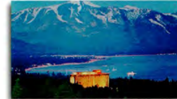
South Lake Tahoe and the Casinos at Stateline, Nevada are just 30minutes away.