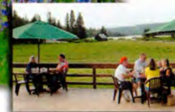
Enjoy dining at our Restaurant and Bar